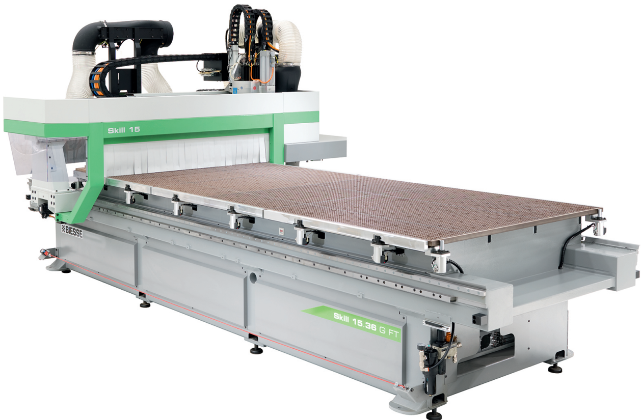
Biesse Skill GFT 1224