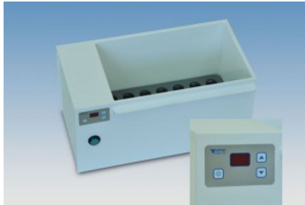
Waterbath Eurotherm II